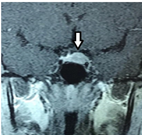
FIGURE 1: Pituitary gland MRI at diagnosis showed a suprasellar mass (arrow)

Preliminary investigation to rule out pregnancy, as a cause for secondary amenorrhoea and galactorrhoea in her was negative. Evaluation of pituitary hormones showed high serum prolactin on consecutive testing, with a level of 466.9 & 467 ng/mL (normal range: 4.0-23). Other pituitary hormones such as follicular stimulating hormone (FSH), luteinizing hormone (LH), TSH, serum oestradiol and progesterone were all within normal range. Her full blood count, lipid profile, renal and liver function tests were also normal. Pituitary gland magnetic resonance imaging (MRI) showed a left suprasellar mass measuring 1.2 x 1.1 x 1.4 cm (Transverse x Craniocaudal x Anterior Posterior). The floor of the sella was thin, and the mass protruded into the sphenoid sinus. Superiorly there was no extension to the floor of the 3 rd ventricle or optic chiasm. There was minimal extension of the mass into the