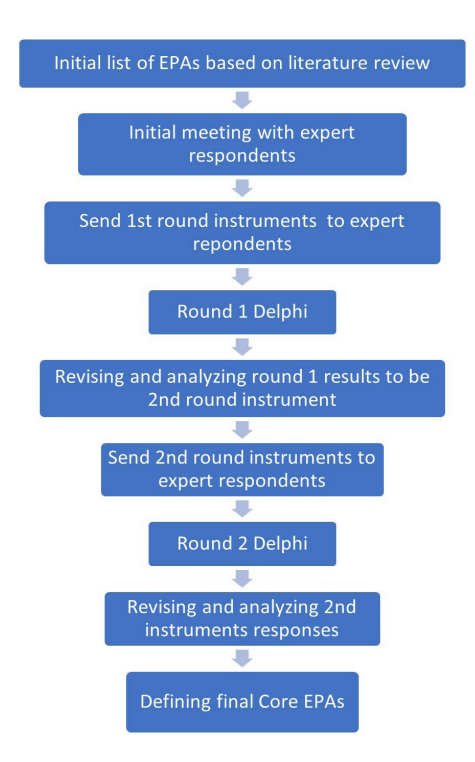
FIGURE 1: The research flow

to them via email, and the completed instrument documents were sent back to the research team email address within the expected time limit.