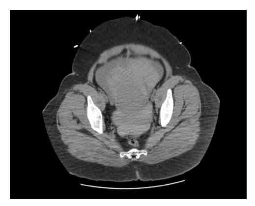
Figure 3: The free fluid in the pelvis shows two densities: 73 HU (central) and 36 HU (periphery), respectively

2.5 cm with enhancing wall (Figure 2). The free fluid in the pelvis showed two densities; 73HU (central) and 36HU (periphery) (Figure 3). Reversed liverspleen attenuation was suggestive of fatty liver. A repeated transabdominal ultrasound by the attending Obstetrics & Gynaecology specialist revealed a complex adnexal mass measuring 2x2 cm, with organised clots surrounding, which may suggest a ruptured tubal