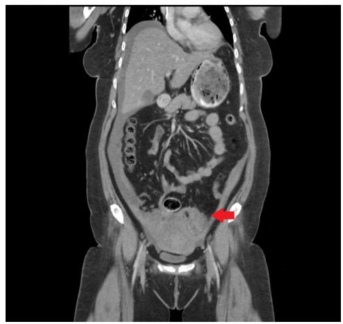
Figure 2: Uterus is anteverted. Cervix is not bulky. There is suggestion of left adnexal cystic lesion measuring 2.5 cm with enhancing wall (red arrow).

CT of the abdomen revealed free fluid in the pelvis, peri-hepatic region, peri-splenic region and along the paracolic gutter (Figure 1). There was also bowel inter-loop free fluid. Uterus was anteverted and the cervix was not bulky. There was suggestion of left adnexal cystic lesion measuring