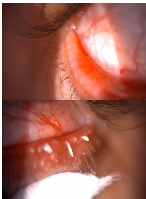
Figure 2: a) Inflamed and capped meibomian glands along lower lid margin; b) Thick, viscous meibomian gland secretions after manual expression of glands with sterile cotton bud

Bortezomib is a proteasome inhibitor derived from boron. It inhibits the threonine residue of the 26S proteasome, which is an enzyme complex that regulates