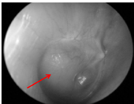
Figure 1: Otoscopic view of tympanic segment facial schwannoma which showed a mass behind an intact tympanic membrane (arrow).